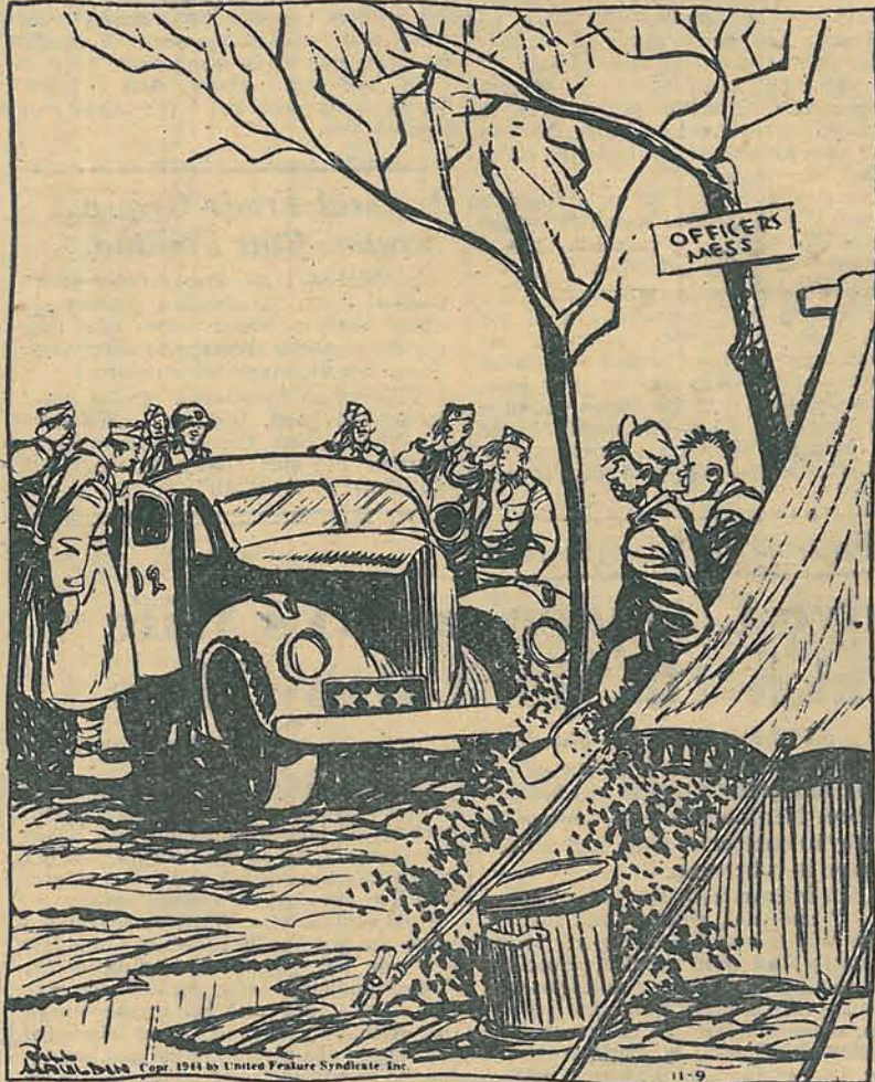
"Another dang mouth to feed."