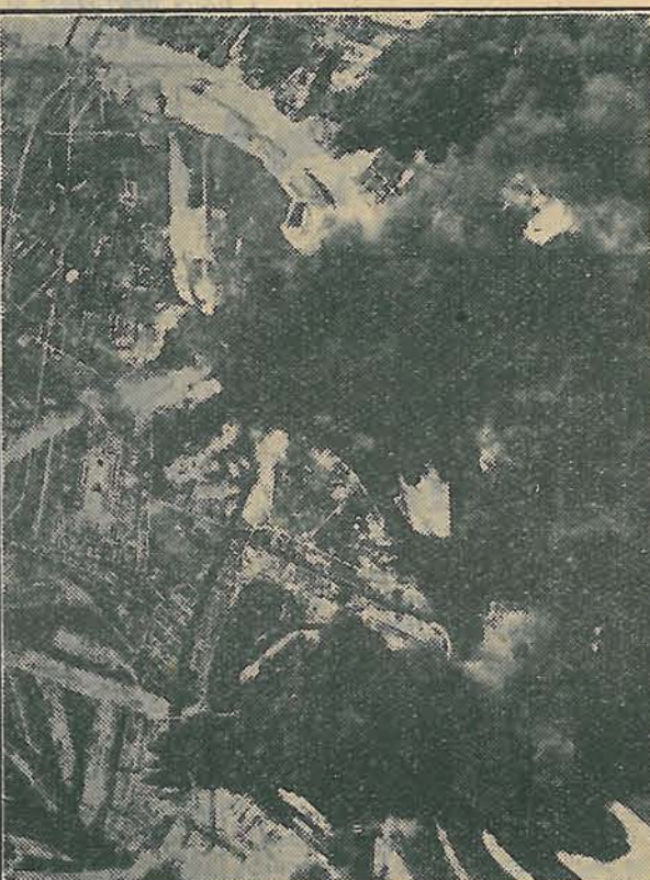
AFTER—The reconnaissance photo above taken a half hour after the attack shows the eight refineries in flame and smoke. Each was reported to have been perfectly pin-pointed by the raid.

In their initial assaults on some of the oil plants last spring, Eighth aircraft encountered little or no flak. Now the same targets are ringed by batteries of anti-aircraft guns. The Germans have been steadily reinforcing the 40-mile-square area in which most of their synthetic-oil plants are situated, moving ack-ack installations into the area from all parts of the Reich. The vicinity around Leipzig, where last Thursday's four oil objectives—Merseburg, Lutzendorf, Bohlen and Zeitz—are