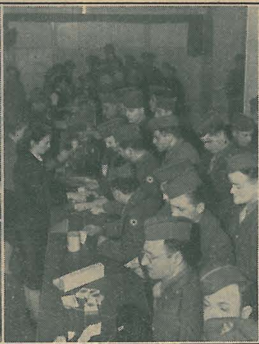
Stars and Stripes Photos

With the lifting of the ban on cigarette sales in the U.K. yesterday, GIs swarmed into the London PX to grab up their butt rations. PX clerks were kept busy handing out seven packs to combatants and five to the noncombatants, and as shown in the pictures above, the boys accepted them with obvious pleasure. The ban on cigarette sales to noncombatant troops went into effect Nov. 28 because of what was described as a "shortage." No official explanation of what happened to the smokes, sufficient quantities of which were reported to have been shipped to troops overseas, has yet appeared.